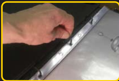
7. Insert Remaining Rings Into Base