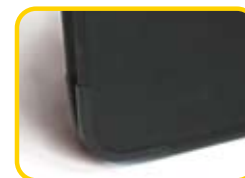
Black corners and fittings