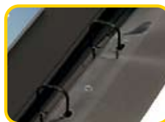
Strong black ring mechanism