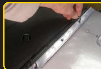
6. Insert Top Ring Into Base