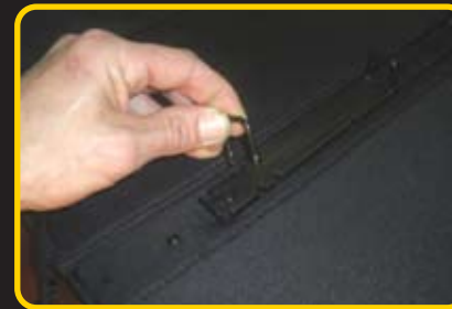
3. Remove All Rings