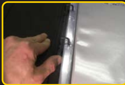
8. Push Slider Back to Locking Position