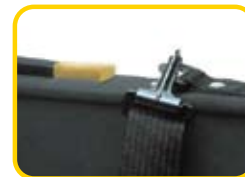
Sturdy fittings for adjustable shoulder strap