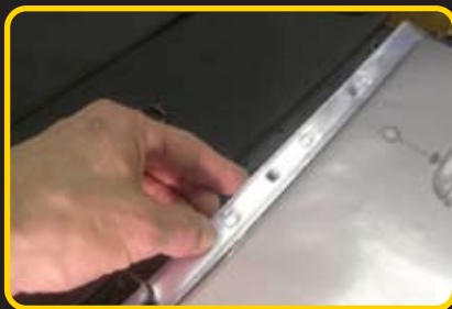
4. Line Up Sleeves With Corresponding Holes On Base