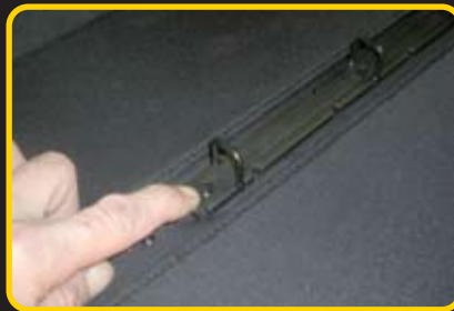
2. Slide Tab Down Until First Click To Unlock