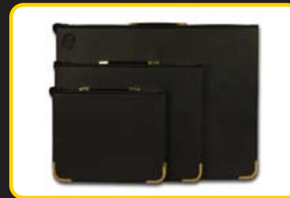
Available on the Premier Maxi Portfolio.