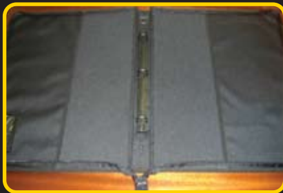
1. Open Portfolio On Flat Surface

The Staylock Binding System is a revolutionary new, easy to use ring mechanism that guarantees no loss of sleeves or broken rings. It also enables you to choose your ring format and is fully adjustable at any time.