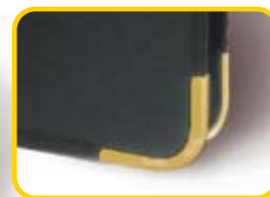
Gold corners and fittings. Strong gold ring mechanism